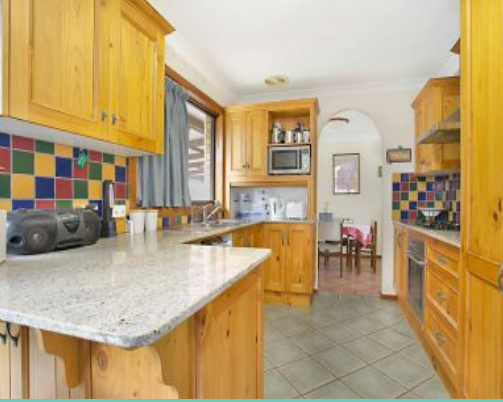
7 Beh Close Singleton, NSW