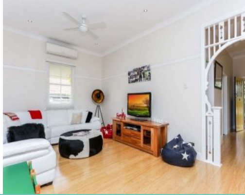
12A Gas Street SINGLETON, NSW